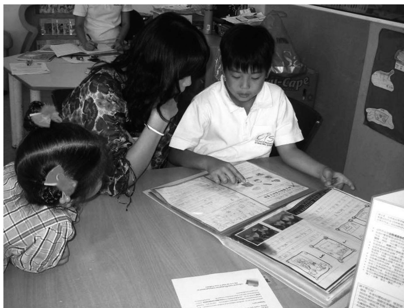
Younger sister attends brother's parent conference

The prime objective of assessment in the PYP is to provide feedback on the learning process. Bruner states that students should receive feedback “not as a reward or punishment, but as information” (Bruner 1961: 26). Teachers need to select assessment strategies and design assessment instruments to reflect clearly the particular learning outcomes on which they intend to report. They need to employ a range of strategies for assessing student work that take into account the diverse, complicated and sophisticated ways that individual students use to understand their experiences. Additionally, the PYP stresses the importance of both student and teacher self-assessment and reflection (examples 14 and 15).